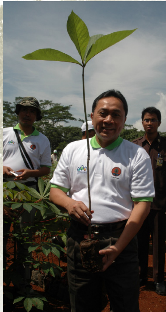
Zulkifli Hasan, SE, MM

Minister of Forestry Republic of Indonesia